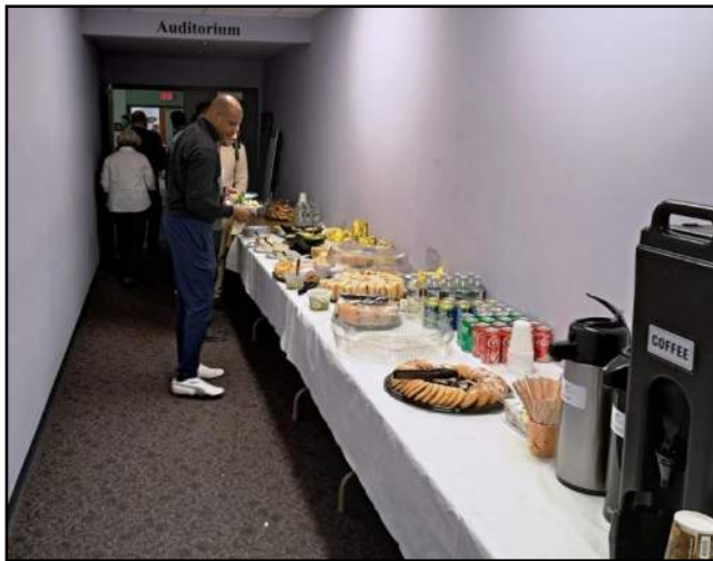
(right) One thing that everybody attending the Fall PDCs always looks forward to is the delicious catered deli luncheon that is provided. Here hungry attendees dig in.